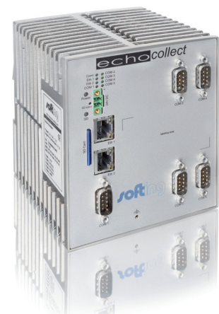
Figure 2: echocollect offers numerous possibilities for data collection via serial and Ethernet interfaces

As a prerequisite to the project, the production facilities needed to be interfaced to Nematik's database system. This was to be done using a device which – installed inside the control cabinet – collects the data from the controllers, and writes it to the database without requiring changes to the PLC program. A special challenge was the legacy machinery at the different manufacturing facilities, which uses different PLCs and different interfaces.